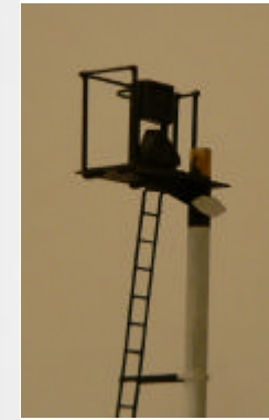
Tall signal showing left hand platform, shunt signal and 2 aspect stencil indicator