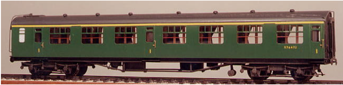
S1 64'6" Corridor First Deep vents D2552 1949