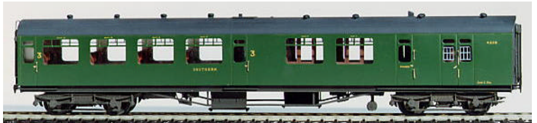
S8 64'6" Semi-Open Brake Third Shallow vents D2123 1946