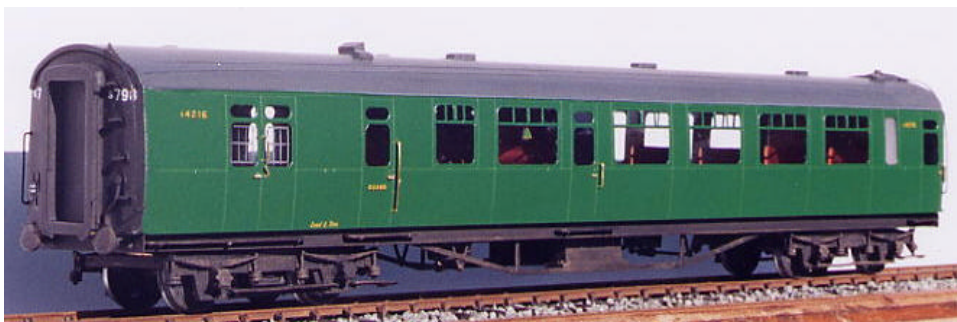
S16 64' 6" Semi-Open Brake Third With coupe D2124 1947