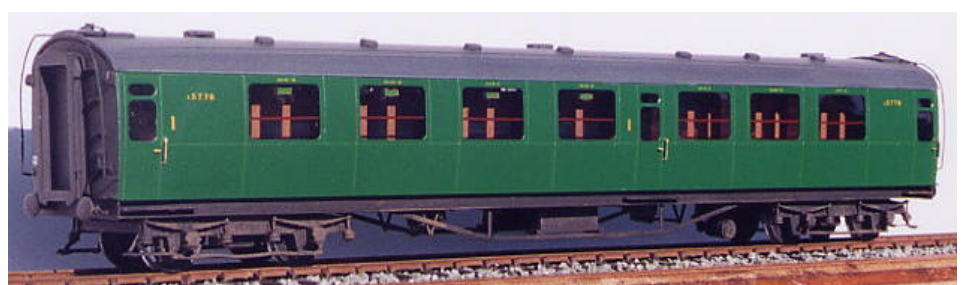
S17 64' 6" Corridor Composite D2320 1947