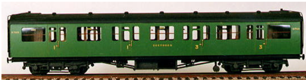
S13 59' Corridor Composite D2316 1945