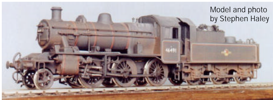
Model and photo by Stephen Haley

The Comet model of the popular 'Mickey Mouse' loco comprises whitemetal castings for the smokebox, boiler and firebox, to give the finished model haulage capacity, with etched brass used where that is necessary for the sake of appearance. The model can be built with a choice of two chimneys, and either strap or plate steps.