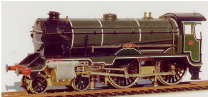
LCP52 SR Schools class, with a Hornby plastic body.