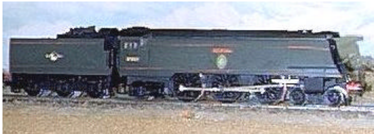
LCP51 Rebuilt West Country/Battle of Britain, shown modified under a Dapol kit body