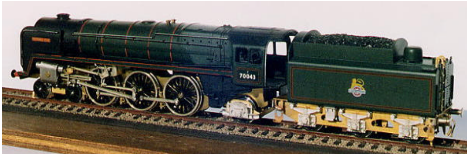
LCP40 BR Britannia 4-6-2, shown with a Hornby plastic body. The tender has a TF5 frame kit running on a TC2 tender chassis and fitted to a plastic tender body