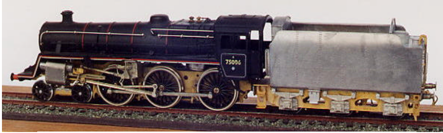
LCP41 BR Class 4 4-6-0 with a Mainline/Bachmann plastic body. Shown with a TK 14 tender kit for the BR Standard BR1F type.