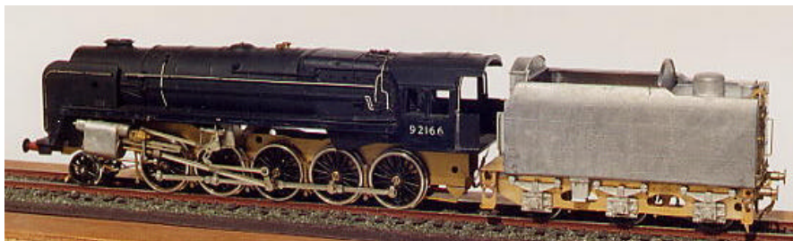
LCP43 BR 9F 2-10-0 with a Hornby body and a TK14 kit for the BR Standard BR1F tender.