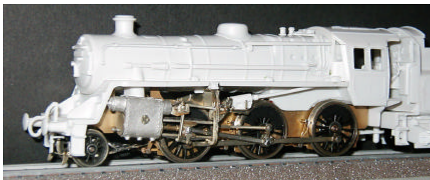
LCP46 BR Class 4 2-6-0, seen with a Dapol plastic body kit. Model and photo by Ian Mellors