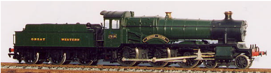
LCP26 GWR Manor/Grange under a Mainline/Bachmann plastic body.