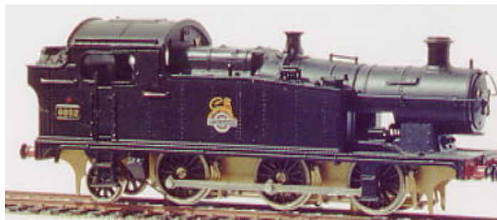
LCP28 GWR 56xx 0-6-2T shown under a Mainline plastic body.