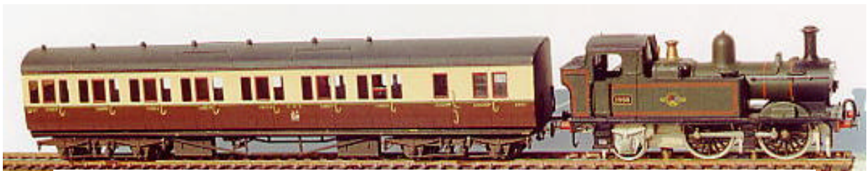
LCP27 GWR 14xx 0-4-2T, seen with an Airfix/Dapol/Hornby plastic body, and W50 coach kit.