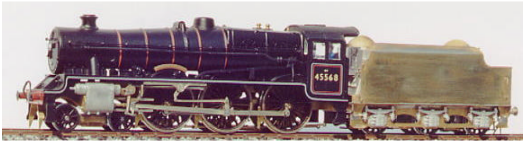
LCP1 (with a TK2) for Royal Scot, Jubilee or Patriot. Seen here with a Mainline Jubilee body. TK2 is a Stanier 4000 gallon welded tender