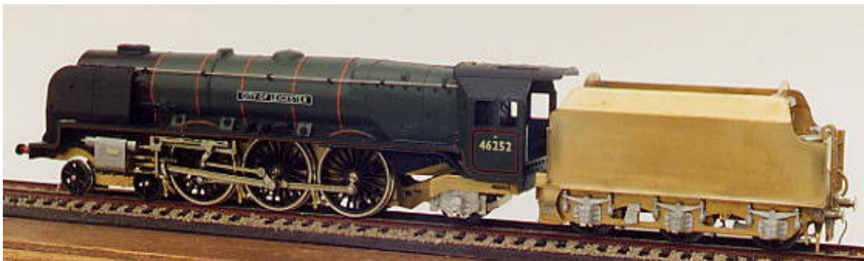
LCP2 (with a TK9) for Coronation class. Seen here with the Hornby body. TK9 is a Coronation de-streamlined tender