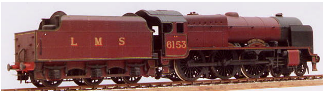
LCP1 (with a TK1) Seen here with a Mainline Royal Scot body. TK1 is a Stanier 4000 gallon riveted tender